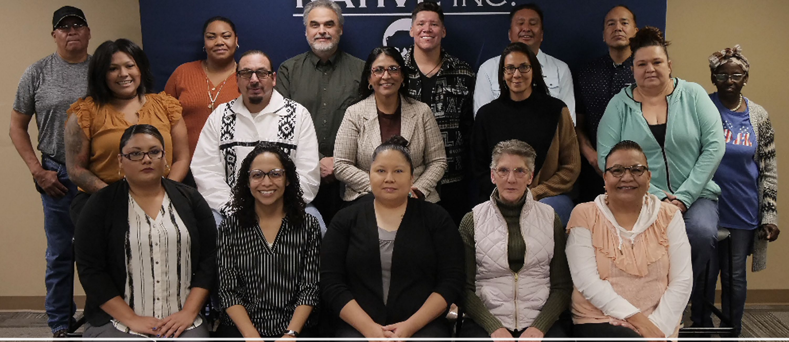
Meet our NATIVE, Inc. Staff | September 8, 2022