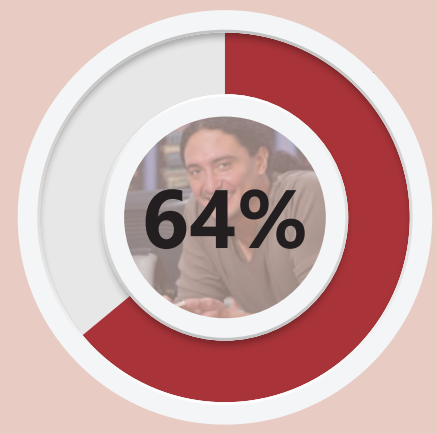
64% of Indigenous adults (ages 35-49) have untreated cavities.